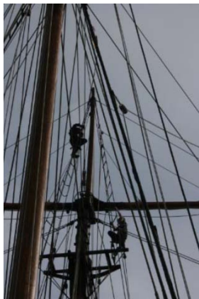
One of our "young at heart" on the shrouds